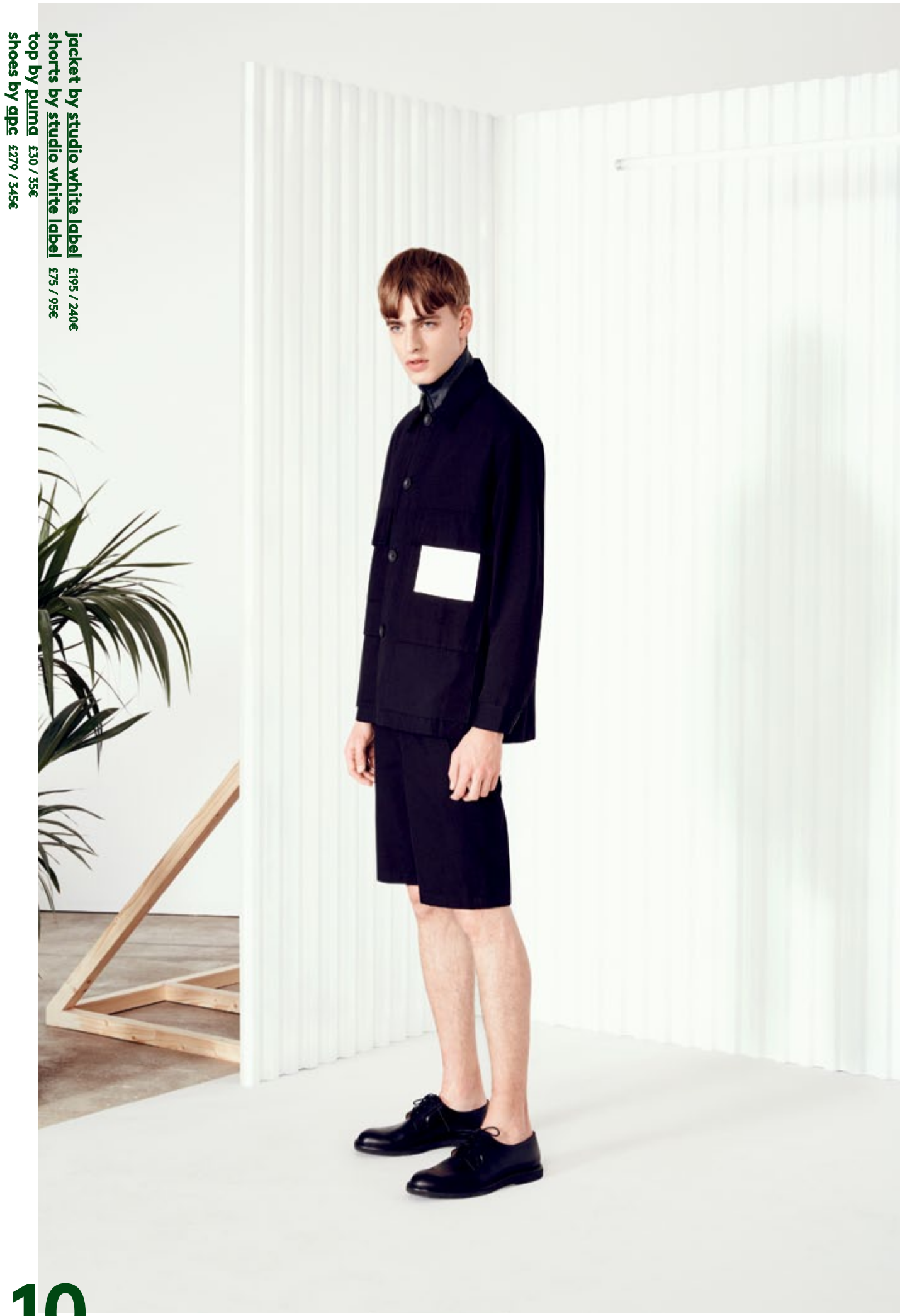
jacket by studio white label £195 / 240€ shorts by studio white label £75 / 95€ top by puma £30 / 35€ shoes by apc £279 / 345€