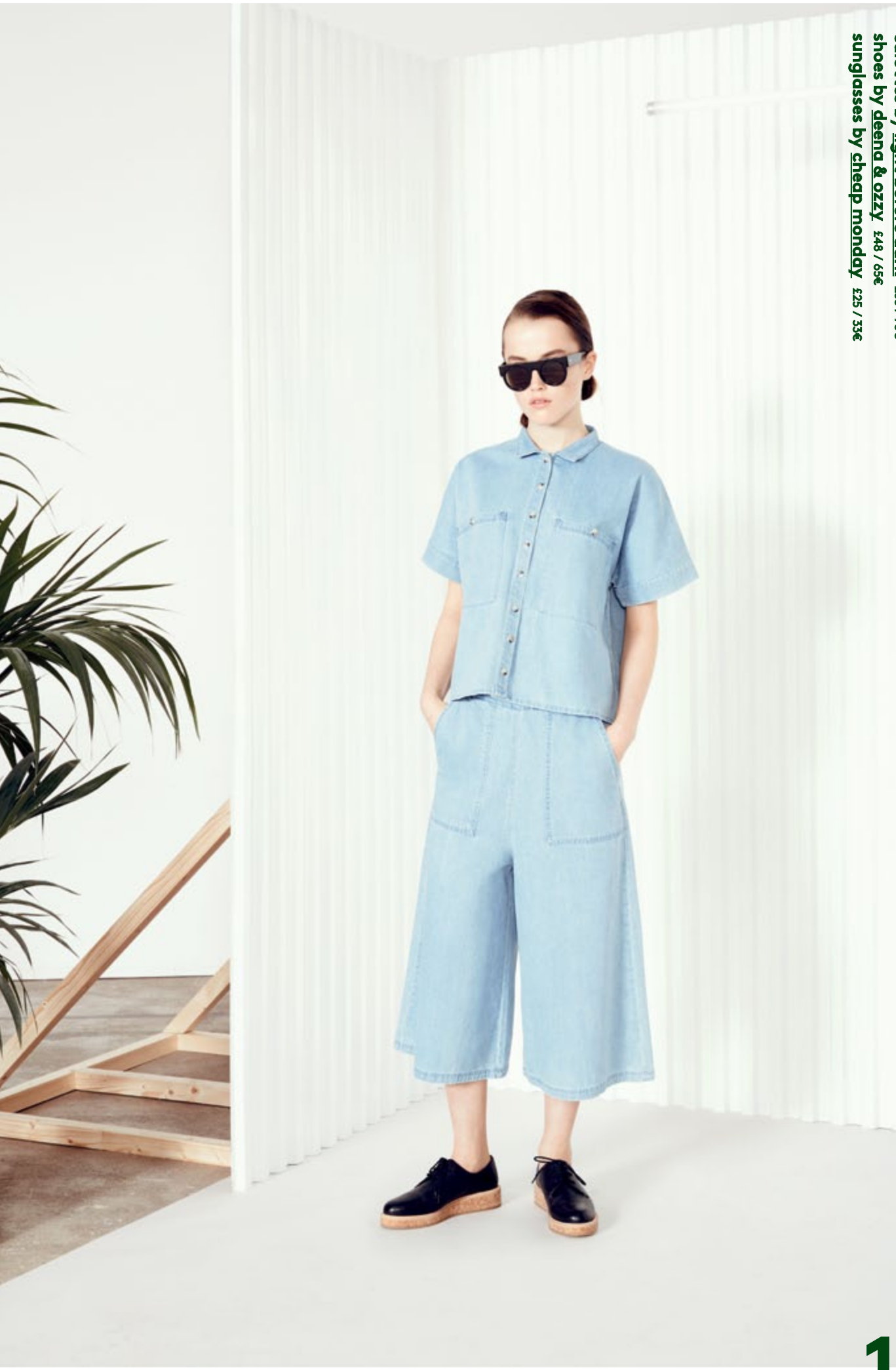
shirt by light before dark £48 / 65€ culottes by light before dark £55 / 75€ shoes by deena & ozzy £48 / 65€ sunglasses by cheap monday £25 / 33€