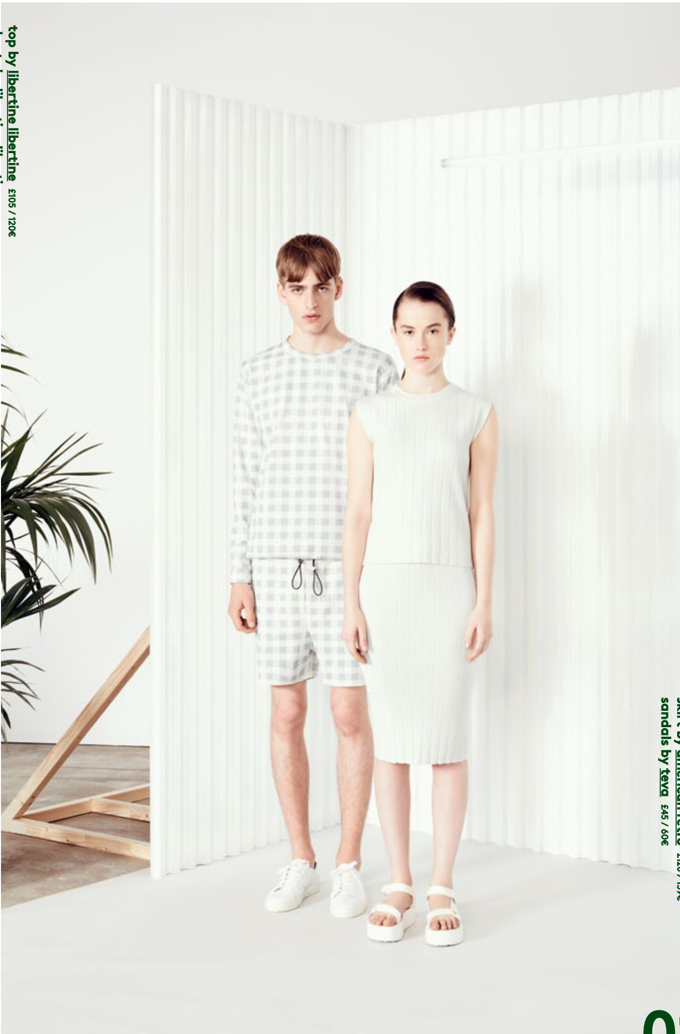
top by american retro £120 / 159€ skirt by american retro £120 / 159€ sandals by teva £45 / 60€