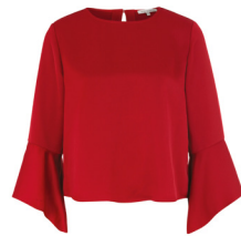
Trumpet sleeve blouse 34,95 €