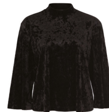
High-neck velvet top 34,95 €