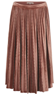
Plisse velvet skirt 49.95€