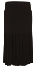
Knit pleated skirt 44,95 €