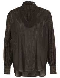
High-neck cut-out blouse 44.95€