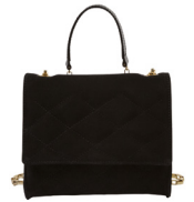
Black quilted suede shoulder bag 49,95 €