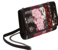
Striped sequin clutch 24.95 €