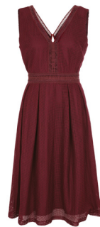
A-line V-neck dress 79,95 €