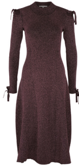
Cold shoulder lurex dress 69,95 €