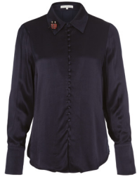
Satin blouse with ladybird brooch 39,95 €