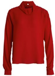
Beadwork band-collar blouse 44,95 €