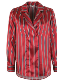
Striped satin blouse 44,95 €