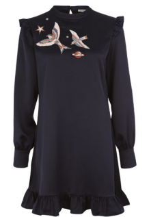
Ruffle dress with bird embroidery 49,95 €