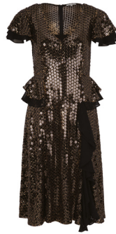
Sequin embroidered cocktail dress 69,95 €