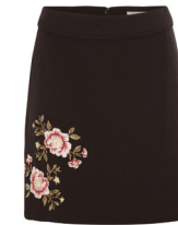
Floral embroidered mini skirt 39,95 €