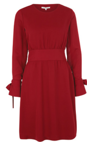
Bow detail dress 59,95 €