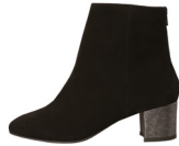
Glitter heel ankle boots 79,95 €