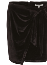
Velvet knot mini skirt 29,95 €