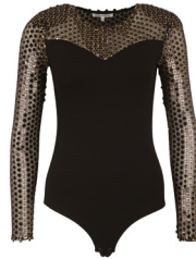
Sequin embroidered body 44,95 €