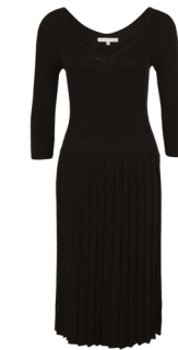
V-neck midi dress 49,95 €