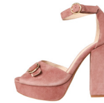
Ring detail platform heels 69,95 €