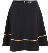
Gold detail mini skirt 39,95 €