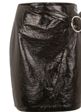
Round buckle patent skirt 49,95 €