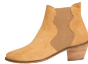
Micro stud ankle boots 79.95€