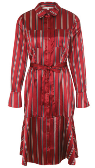
Striped satin dress 49,95 €