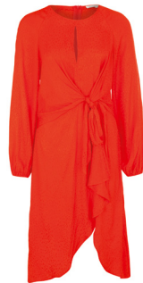
Luxe knot detail dress 59,95 €