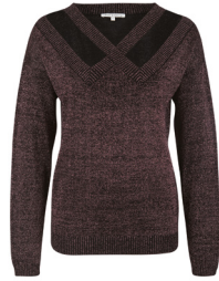
Cut-out lurex sweater 39,95 €