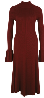
Bell sleeve knit dress 69,95 €