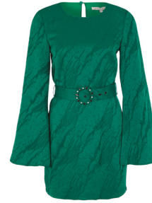
Trumpet sleeve mini dress 64,95 €