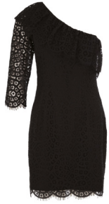
One shoulder lace dress 49,95 €