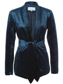
Structured velvet blazer 69,95 €