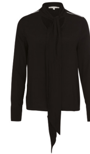
Pussy bow blouse 39,95 €