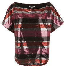
Striped sequin carmen top 49,95 €