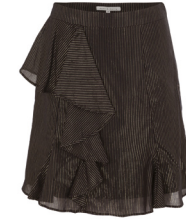
Draped layer skirt 39,95 €