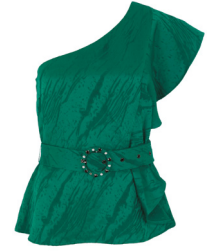
One shoulder belt top 34,95 €