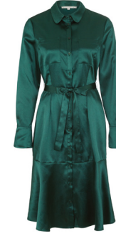
Belted satin shirt dress 49,95 €