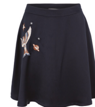
Mini skirt with bird embroidery 39,95 €