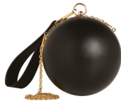
Ball bag with goldchain 29.95€