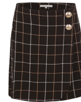
Check mini skirt 34,95 €