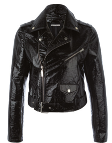
Patent jacket 89.95€