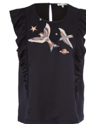
Ruffle blouse with bird embroidery 34,95 €