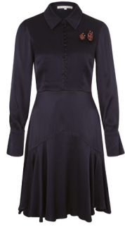
Satin dress with ladybird brooch 59,95 €