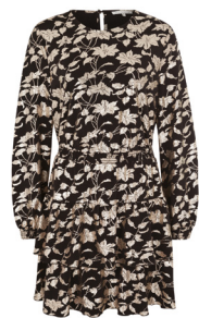
Floral mini dress 49,95 €